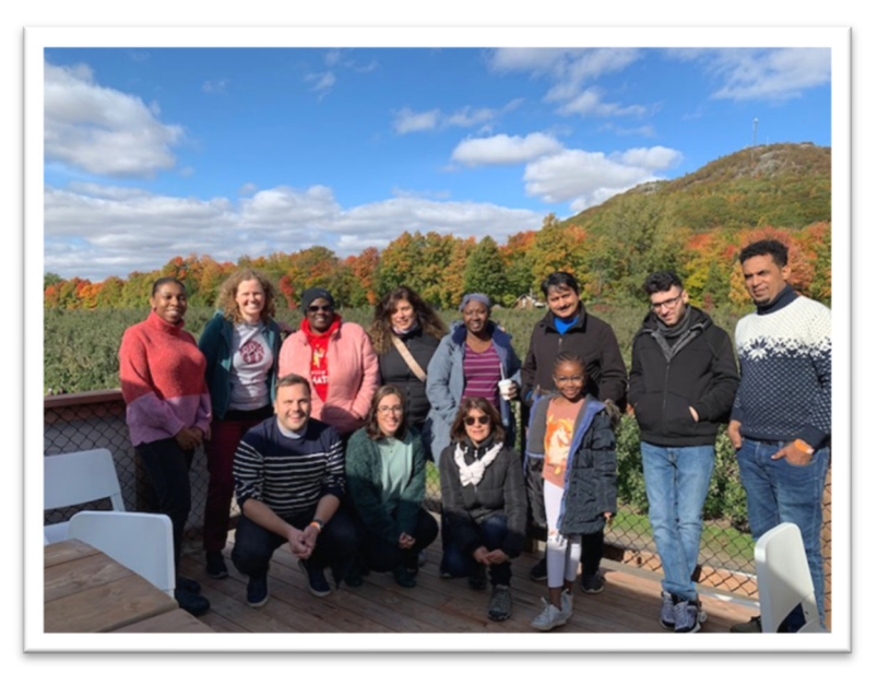
Staff team and some program participants at our apple-picking event. October 2022.

Third, and as mentioned above, the sponsorship program has been busy with increased arrivals compared to recent years. With costs of living rising, we hope to increase our support to sponsored persons as they adjust to life in a new country. 160 individuals are still waiting to arrive in Canada, and we are working on a new round of applications to submit to the provincial government. We share our expertise with others, as we have been involved in leading training sessions on submitting refugee sponsorship applications for the general public.