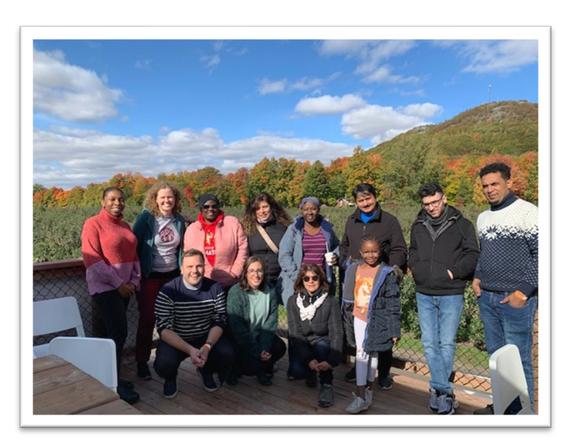
Staff team and some program participants at our apple-picking event. October 2022.

Third, and as mentioned above, the sponsorship program has been busy with increased arrivals compared to recent years. With costs of living rising, we hope to increase our support to sponsored persons as they adjust to life in a new country. 160 individuals are still waiting to arrive in Canada, and we are working on a new round of applications to submit to the provincial government. We share our expertise with others, as we have been involved in leading training sessions on submitting refugee sponsorship applications for the general public.