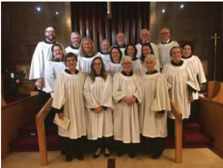
St John the Baptist Choir

We have traditionally offered two Sunday services , one at 08:00 am and the other at 10:00 am. As worshippers arrive for the 10:00 am service they are met at the door by a member of our team of greeters and then given a second welcome by one of our sides people who also offer them a program as they walk into the nave. We have a regular coffee half-hour following the 10:00 o'clock service. During the interregnum period we are conducting one 9:30 am Sunday service. In the past, we provided a Sunday Church School and creche. This was interrupted by the pandemic but we plan to offer both once more, starting the fall of 2023. To encourage the full participation of young families in our worship services and to provide an additional opportunity for the congregation to meet at table and enjoy each other's company, in the past we have organized a successful monthly family service which was followed by a light lunch.