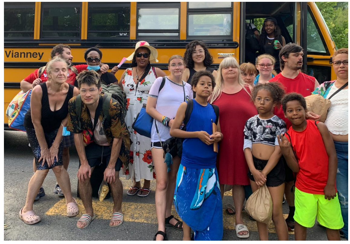
On the road again... Folks from the Mile End Mission embark on another adventure! Photo supplied.

The Mission's fabulous Leadership team of volunteermembers continued to ensure