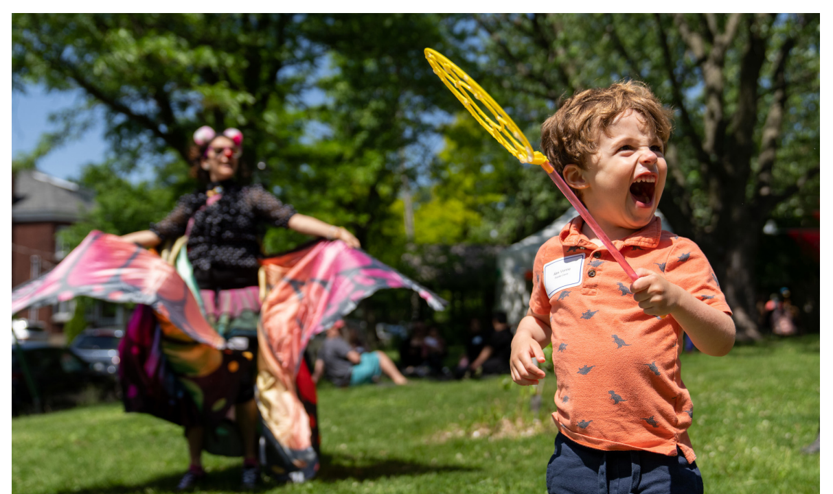
Family Day fun included clowns, bubbles and lots of smiles.

I think this offers a model for our churches to consider. Many of us continue to struggle with the idea that we should be getting more people to come on