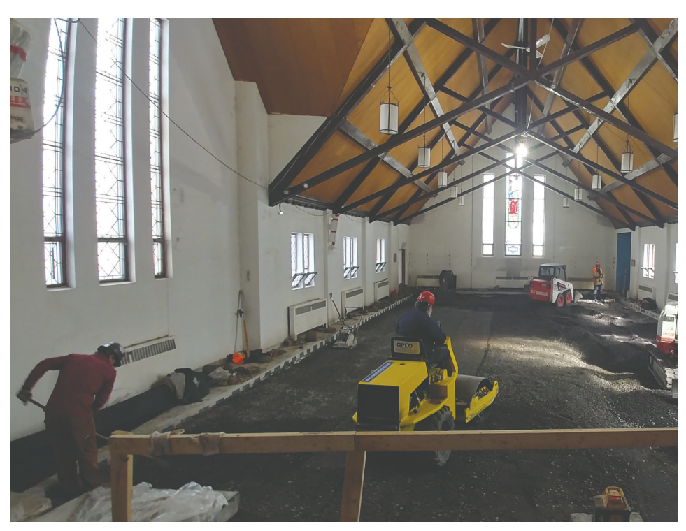
Church interior demolition (removing the old concrete floor in preparation for pouring a new concrete floor).