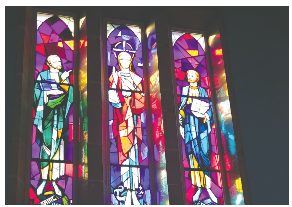
The beautiful original St Mark's windows restored.

Another principle was to update the technology with new sound, wifi, and projection systems. The new sanctuary uses furnishings from both former churches, including the altar from St Mark's and the altar rail from St. Peter's. (The altar has been put on wheels and the rail is removable, so that the front can be used for different types of events.)