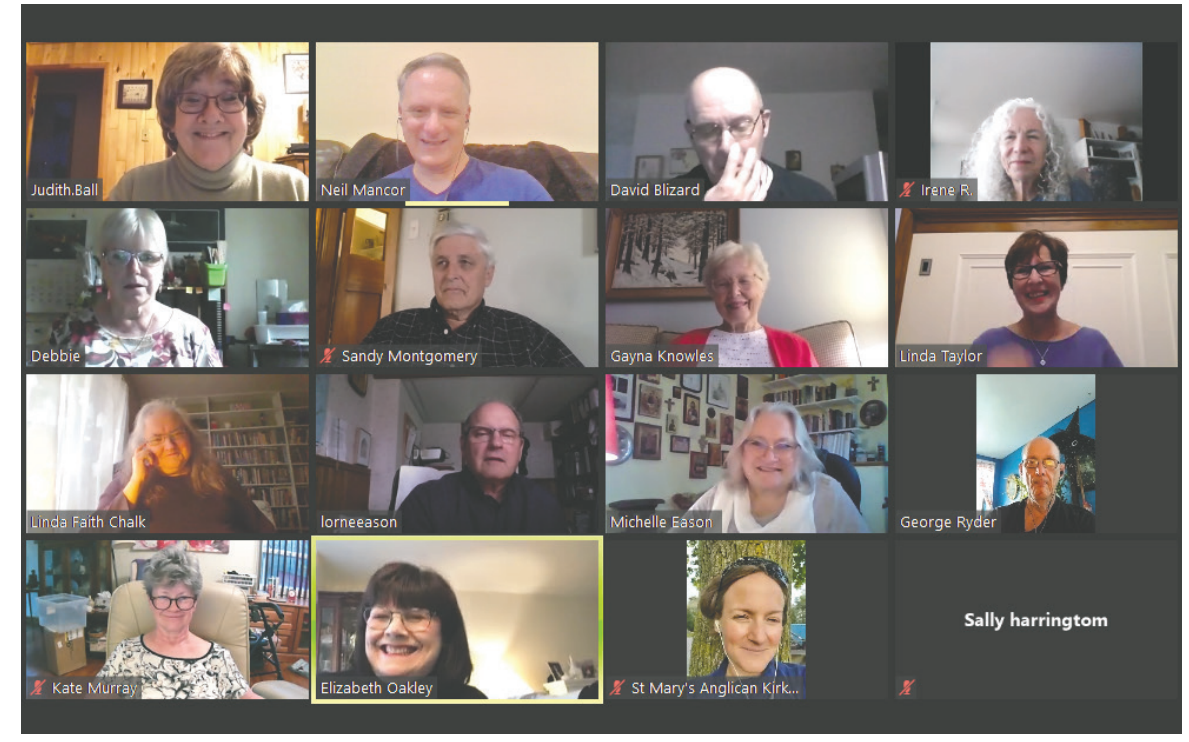
The West Island revive group "together" for a group picture.

Back in March, we had only just launched a Revive group on the West Island. Very quickly we adjusted to the new