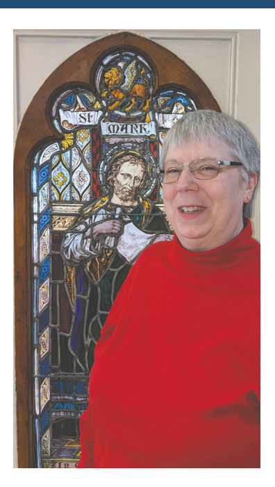
"Another coworker told me that he is a nihilist and will never believe in God, yet he sits with me at the end of shift almost every evening and wants to talk about the Bible and God."

This connection was definitely an epiphany for me. I had thought lab work and ministry are vastly different from one another. Lab work can be stressful with emergency stat work and the constant pressure for a quicker turnaround time for all test results; it doesn't leave a lot of time for reflection of any sort. Life as a priest will have its own stressors with pastoral care, teaching and administrative duties in addition to what most people perceive as our Sunday ministry. Does God want me to keep my