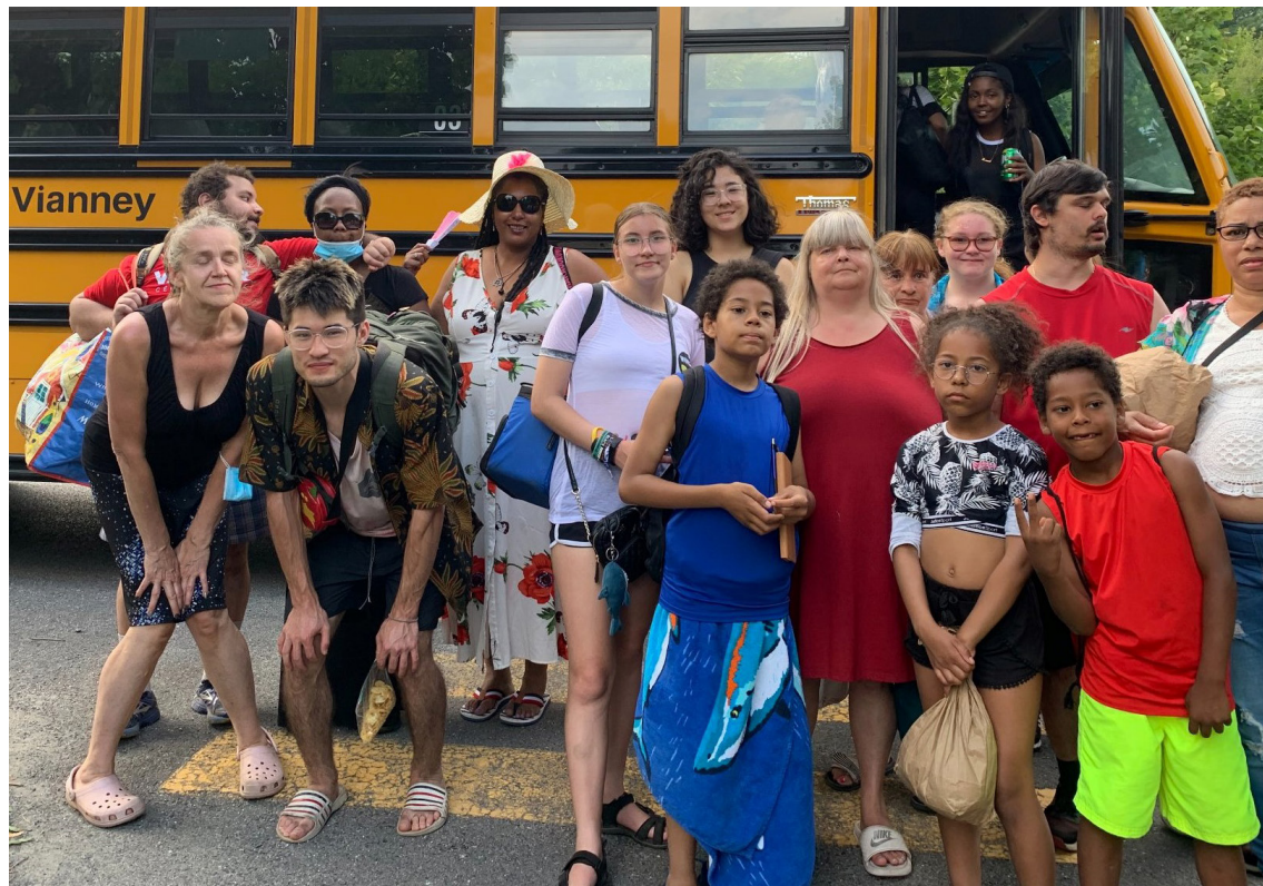
On the road again... Folks from the Mile End Mission embark on another adventure! Photo supplied.

The Mission's fabulous Leadership team of volunteer-members continued to ensure