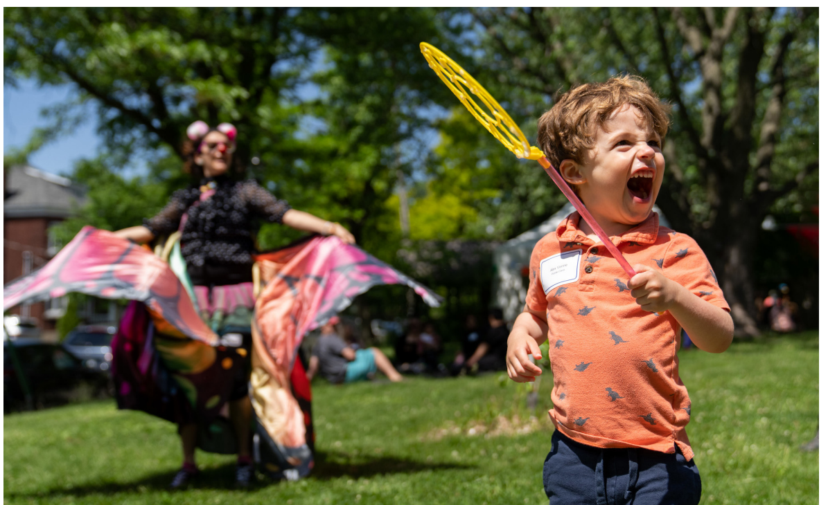
Family Day fun included clowns, bubbles and lots of smiles.

I think this offers a model for our churches to consider. Many of us continue to struggle with the idea that we should be getting more people to come on