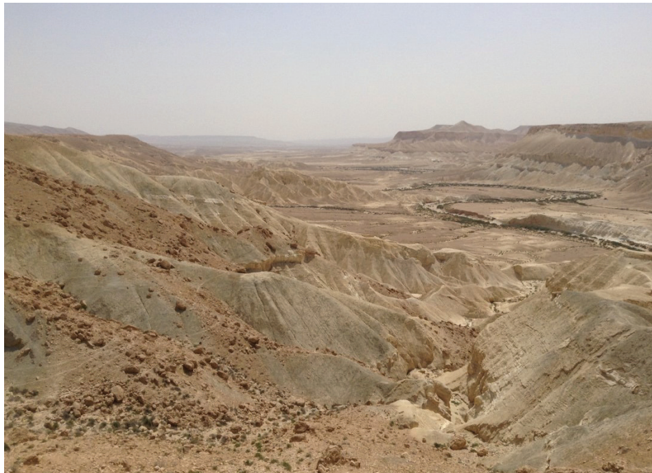
The wilderness of Tsin canyon/Le désert du canyon de Tsin.

It was in the wilderness that Jesus chose the path that God had called him to follow. What kind of disciple of Jesus does God want us to be?