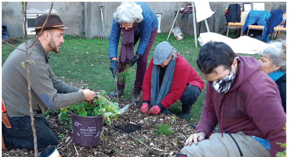
Planting the pocket forest undergrowth. Photo supplied.

Twenty or so people signed up for the workshop, although